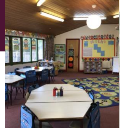
Carpet area and tables. Each child will have their own SMART sack on their chair. This will contain all of their equipment and learning resources.