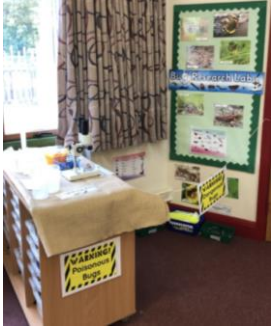
Role Play Area