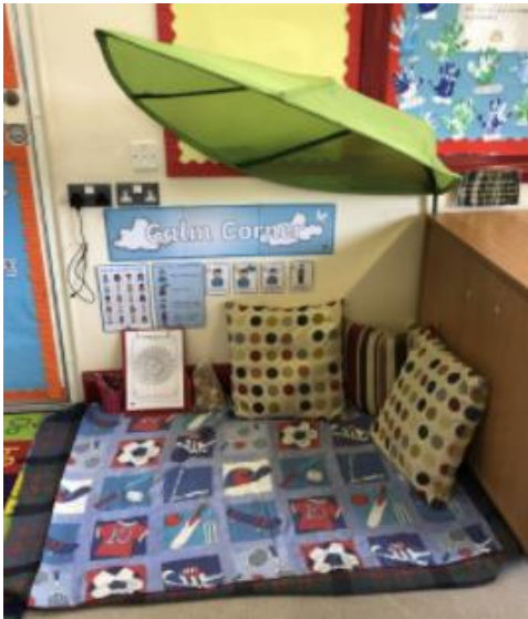
Calm corner – drawing and small world area