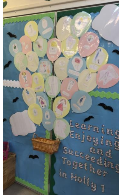
Learning, enjoying and succeeding together in Holly 1 hot air balloon.