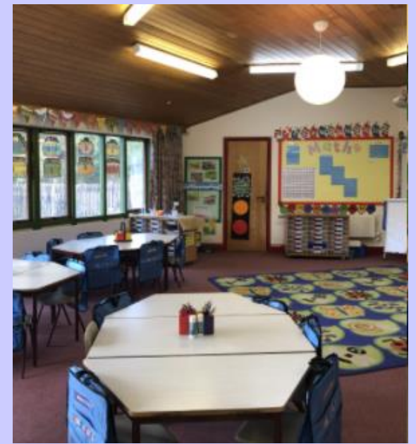
Carpet area and tables. Each child will have their own SMART sack on their chair as can be seen in the image above. This will contain all of their equipment and learning resources.