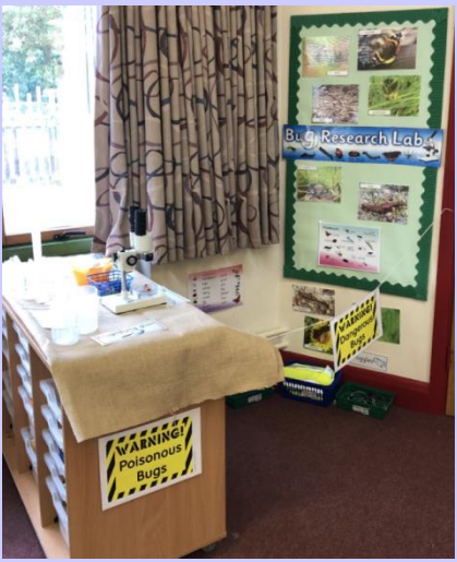
Role Play Area