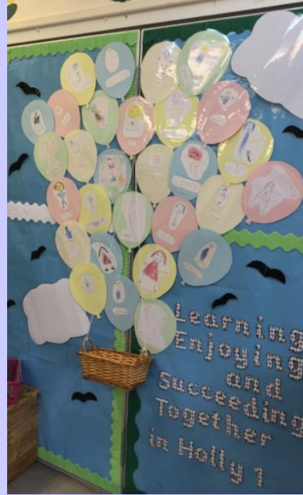
Learning, enjoying and succeeding together in Holly 1 hot air balloon.