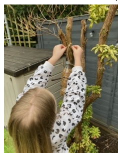
Isabella made her own bird feeder to attract more birds to her garden.