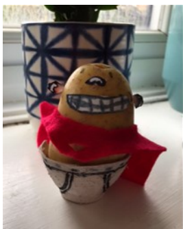
Hugo Oak 2 Captain Underpants