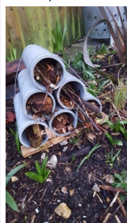
Tyler's animal Shelter.

Thank you to everyone who completed the challenge of wildlife spotting and for encouraging wildlife around their homes. In school, we created posters based on the topic 'innovating for the future' and we will reveal the winner for each class shortly which will then be entered into a national competition.